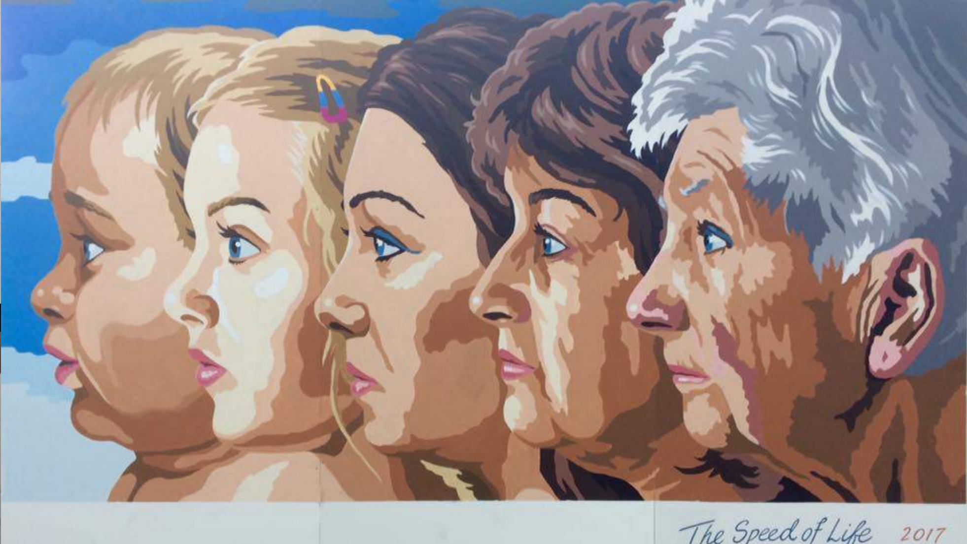
The Speed of Life 2017