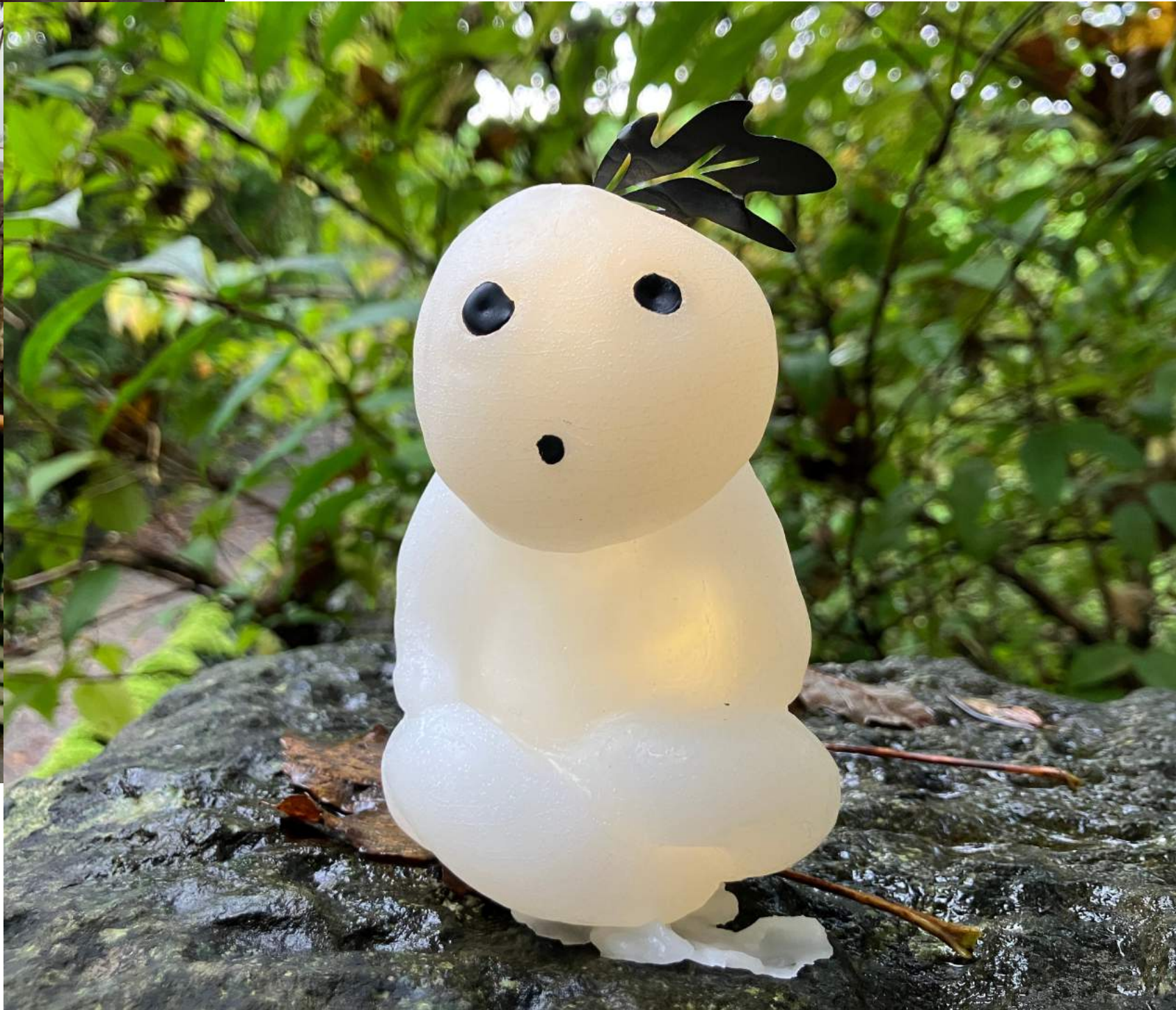
(Above) Yarn in the Yards - A property chain of woollen houses were created for an installation for the Westmorland Gazette yard (2016). (Right) I have run Ulverston's Candlelit Walk as a volunteer for 13 years. This annual Halloween light festival galvanizes creative volunteers to make diverse light installations and attracts 1,000 people annually. I make wax characters for the walk, onion lights, fire displays and organise an annual community workshop to create shadowscreens & papercuts.