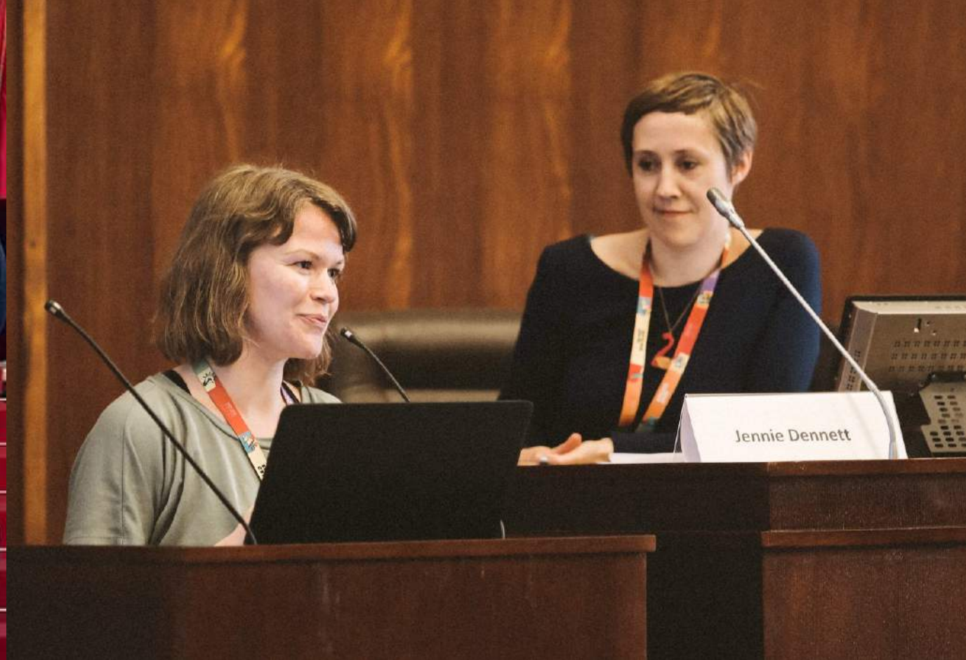
Presenting the international finalists for The Amateo Award in Novi Sad, Serbia, 2019. This is a prize funded by Creative Europe to recognise voluntary arts projects with exceptional social impact. As part of the Flagship Events team, I organised the prize for two years. This is the 2019 winner, Moving Ground from Belgium who helped children from diverse backgrounds put on a neighbourhood show, breaking down barriers.